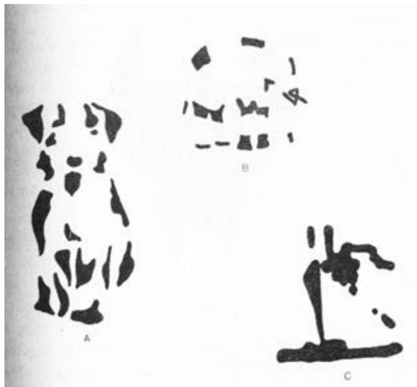
Figure 5. 1. Incomplete figures

It also is easier to perceive the familiar than the unfamiliar. Study Figure 5.1 until you have identified all three elements. How long did it take you to identify each of the three figures? You probably identified the dog first, then the ship, and finally the elephant. This corresponds to the relative familiarity of the three images. The familiar, of course, is the expected.